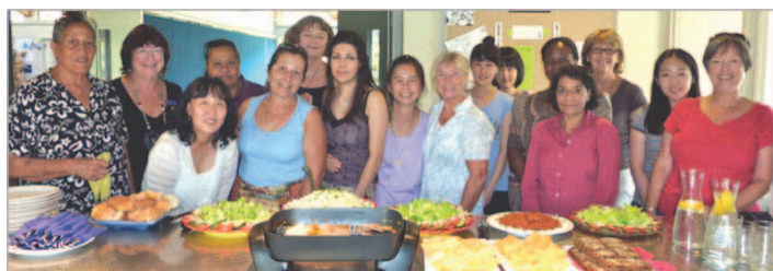
Cooking and Friendship Workshop.

Initially launched with Somali women, it then expanded with the addition of Bangladesh, Burmese, Sri Lankan, Singapore, Kenyan, Kiwi and others.